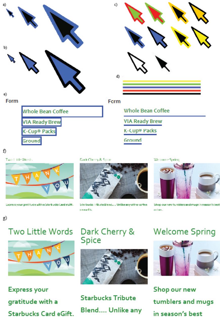
Fig. 1. Some of the features present during the first user experiment. a) Mouse cursor sizes; b) Mouse cursor over links; c) Available cursor colours; d) Link enhancement colours; e) Link enhanced with box/underline; f) Webpage with high zoom and low font size; g) Page with low zoom and high font size.